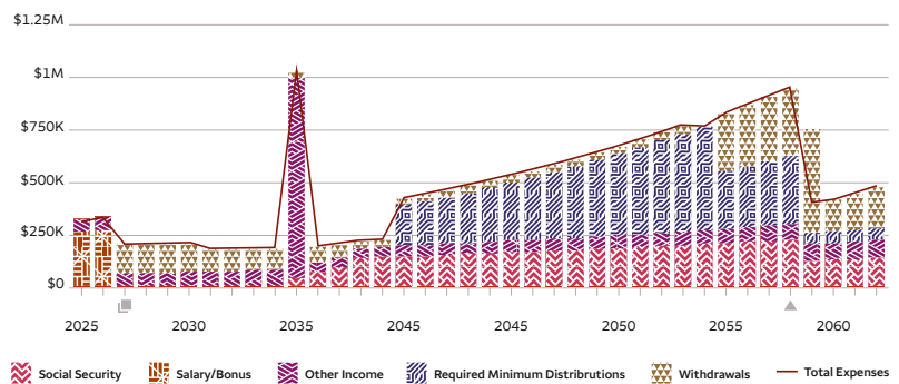
Cash Flow Analysis